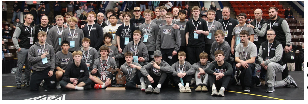
Left: The CSM State Runner-Up Wrestling team poses together with their trophy.

CSM gave the now 4-time team State Champions everything they had! They had a phenomenal season, ending with a 26-2 overall record!