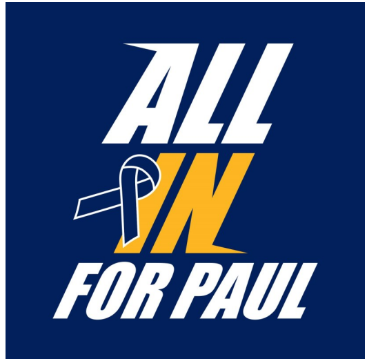
Above: Logo created by Jack Pearl Team Sports of Battle Creek.