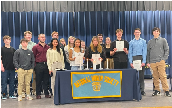
Left: Current members of the National Society pose with new members.