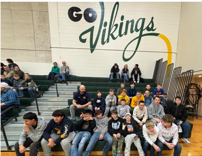
Above: The boy's Jr. High basketball teams enjoy the Glen Oaks basketball game.