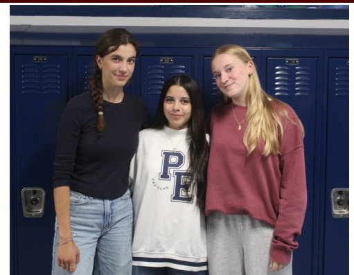
Above: Our exchange students gather together for a picture.